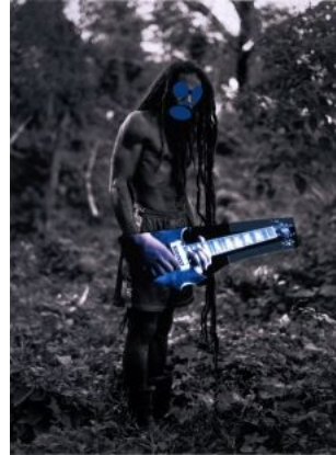
Richard Prince, Graduation

3 Between November 8 and December 20, 2008, the Gallery put on a show featuring 4 twenty-two of Prince’s Canal Zone artworks, and also published and sold an exhibition catalog 5 from the show. The catalog included all of the Canal Zone artworks (including those not in the 6 Gagosian show) except for one, as well as, among other things, photographs showing Yes 7 Rasta photographs in Prince’s studio. Prince never sought or received permission from Cariou to 8 use his photographs.