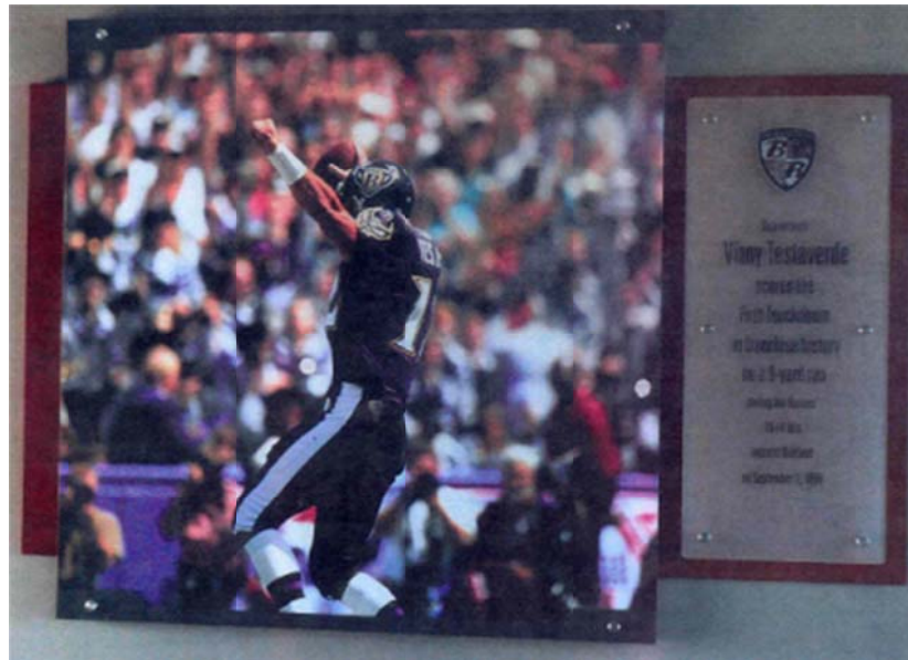
"Quarterback Vinny Testaverde scores the First Touchdown in franchise history on a 9-yard run during the Ravens' 19-14 Win against Oakland on September 1, 1996."