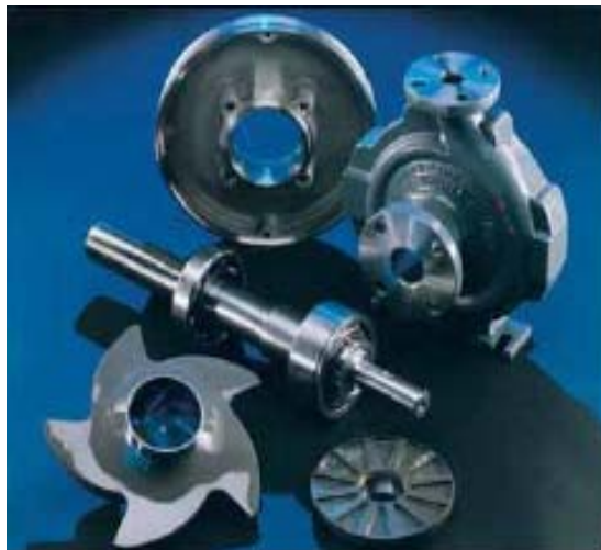
Flowserve IMAGE 3