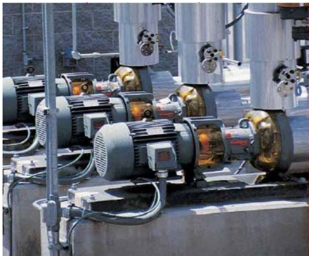
Flowserve IMAGE 1 3