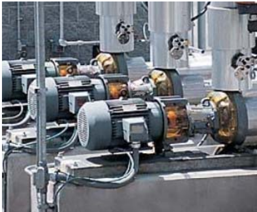
Hallmark IMAGE 1