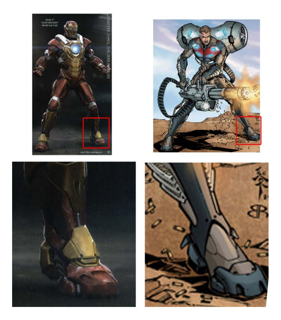
(Dkt. No. 45 at 16 (citing Dkt. No. 37 ("Litvak Decl.") Exs. O-63, F).)

First, the Court notes that "manipulat[ing] the images . . . by cropping them, rotating them, and the like" are "tactics" that "cannot be used to bolster an infringement claim." Dean v. Cameron , 53 F. Supp. 3d 641, 647-48 (S.D.N.Y. 2014). Even putting that aside, however, no reasonable juror could find that there is substantial similarity between the Iron Man and Radix boots as depicted. The boots have completely different colors (Radix: blue and gray; Iron Man: red and gold); the heels appear to differ (Radix: heel with spur; Iron Man: gold square near ankle); the top-foot is of a totally separate nature (Radix: angular and receding into the shin cover; Iron Man: gold and protruding from the toe box); and the toe boxes are differently sized and shaped (Radix: rounded and covers only the toes; Iron Man: boxier and covers more of the