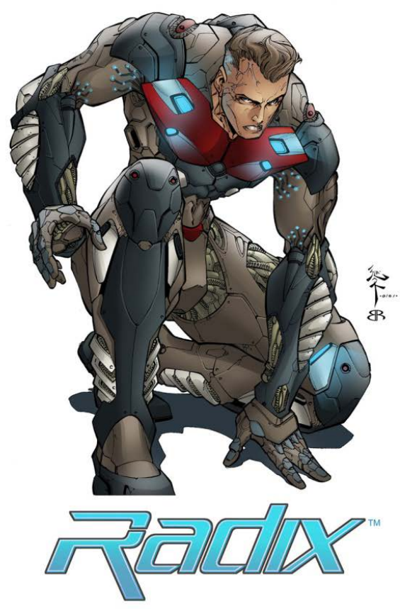
(Compl. Ex. B.)

The Court first notes that it will apply the "more discerning" substantial similarity analysis because the work contains both protectable and unprotectable elements, as discussed below. Laureyssens , 964 F.2d at 141. In order to grant this motion to dismiss as a matter of law, therefore, the Court must find that "no reasonable jury, properly instructed, could find that the two works are substantially similar." Peter F. Gaito , 602 F.3d at 63 (quoting Warner Bros. , 720 F.2d at 240). The Court first "attempt[s] to extract the unprotectible elements from our consideration and ask[s] whether the protectible elements, standing alone , are substantially similar." Knitwaves Inc. , 71 F.3d at 1002.