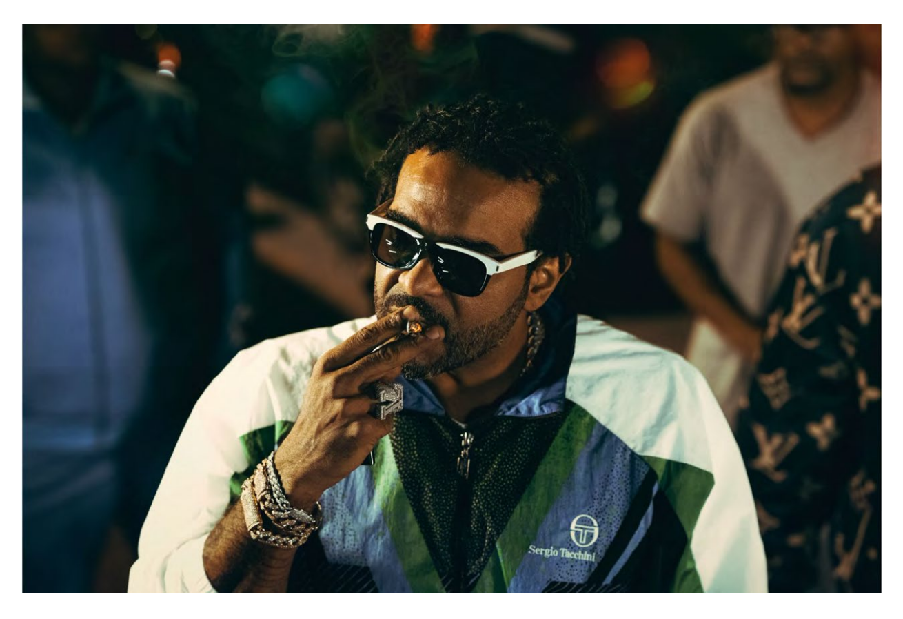
(Compl't ¶ 13 & Ex. A.)

The Complaint makes frequent reference to a "license" granted from Crowley to Villegas for the Photograph, conditioned on crediting Crowley as the photographer. (See, e.g., Compl't ¶ 16, 17, 18, 22, 34.) The Complaint does not set forth the precise terms of the license or the words used to grant the license. Defendants' motion annexes an exchange of text messages between Crowley and Villegas about the use of Crowley's photographs. (Docket # 43.) In opposition, Crowley does not dispute that these messages were the basis of the purported license. (Opp. Mem. at 5-8.) Because these messages appear to constitute the license referenced throughout the Complaint, they are properly considered on this Rule 12(b)(6) motion. Goel v. Bunge, Ltd., 820 F.3d 554, 558-59 (2d Cir. 2016) (documents integral to a complaint may be considered on a motion to dismiss).