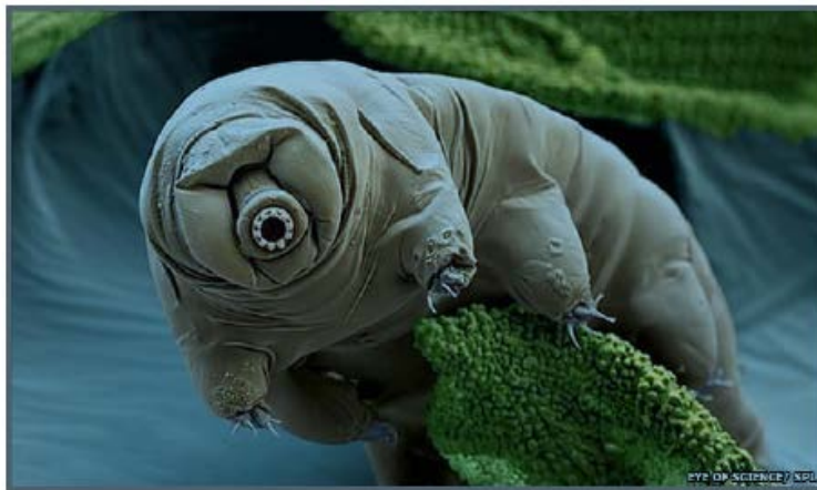
Tardigrades are microscopic animals commonly known as water bears

The tardigrade, also known as a "water bear" or "moss piglet," is a microscopic eight-legged animal less than one millimeter in length. App'x at 149.