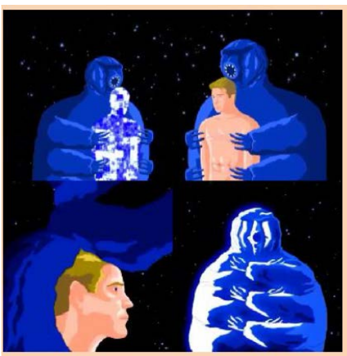
App'x at 71 (Abdin's tardigrade).

Videogame, the tardigrade "envelop[s] a human being" and the tardigrade flies through space with the person inside it. Appellant's Br. at 14-15; see also App'x at 71 (depicting the "tardigrade hug"). In comparison, in Discovery , Ripper is confined in a glass chamber aboard the Discovery , hooked up to the DASH Drive, and used as a supercomputer to guide the ship as it jumps to different parts of the galaxy. As to physical traits, while the tardigrade in the Videogame is a luminescent blue and Ripper does appear to be blue at times, it is primarily a darkish-brown or greenish color and its coloring seems to change. Compare App'x at 71 (blue tardigrade enveloping Carter), with Suppl. App'x at 143 (7:30) and Suppl. App'x at 143 (25:42) (green or brown Ripper), Suppl. App'x at 145 (29:38-30:50) (greenish brown Ripper).