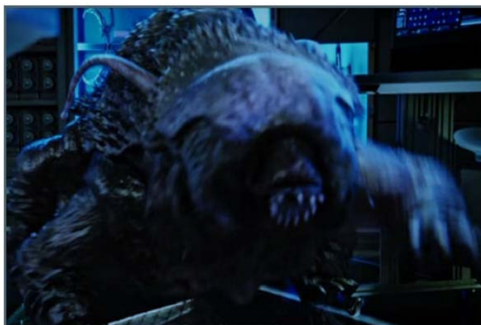
Suppl. App'x at 143 at 25:42 (Ripper).