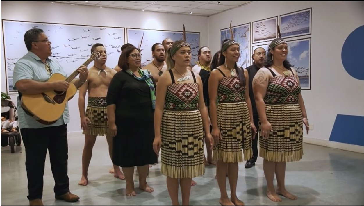
Figure 1, 1:33:24 8

In the shot captured in Figure 1, Plaintiff's photographs displayed on the back and right-side walls of the exhibit are visible. These include—on the back wall, from left to right— Compl. Exs. E and F ; and—on the right wall, from left to right, moving clockwise— Compl. Exs. G, H, I, and J . Analyzed under the Ringgold factors, see Ringgold , 126 F3d at 75, the photographs marked in the complaint as Exs. E and F are each observable for approximately three seconds; they appear in the background, at a distance, and out of focus. See Figure 1. Approximately half of Ex. E is obstructed by the performers, who stand blocking much of the bottom half of the photograph; and the majority of Ex. F appears obstructed by the performers, standing in front of and blocking most of it. Id. This degree of obstruction militates in favor of a finding of de minimis use of Exs. E and F in this shot. See Gottlieb Dev. LLC , 590 F. Supp. 2d at 632; LMNOPI , 449 F. Supp. 3d at 92. Additionally, in this shot, Ex. F is hardly discernible to a lay observer as a photograph of airplanes at all, let alone