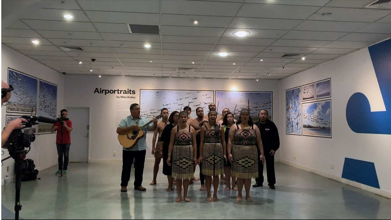
Figure 3, 1:33:41 10

The third shot, represented by Figure 3, is almost identical to the view we have of the photographs in Figure 2. 11 The same observability conditions, see Ringgold , 126 F3d at 75, are present with respect to each photograph’s degree of obstruction, lighting, focus, camera angles, distance, and presence in the background of the shot—except the photographs in this shot are visible for six (in the case of Compl. Exs. A, B, C, and D) to eight (for Compl. Exs. E, F, G, H, I, and J) continuous seconds at a time. See the Film , at 1:33:37–45. Though this shot contains a lengthier depiction of each photograph, it remains clear that the photographs are not the focus of the scene; the focus is the performance of Eilish’s song for her, and Eilish’s reaction thereto. Cf. LMNOPI , 449 F. Supp. 3d at 91. Indeed, the shots represented in Figures 2 and 3 are broken up by a three-second intermission wherein the camera pans to Eilish and her family members to capture their reactions to