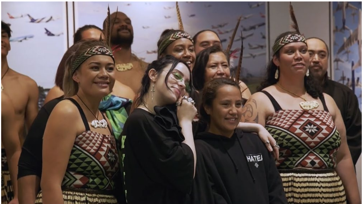
Figure 5 1:34:03 13

The photographs visible in Figure 5 are hardly recognizable as the Plaintiff's photographs at all. On the back wall, Compl. Ex. E (left side) is observable here for approximately one second; the majority of Compl. Ex. E appears out of frame, it is partially obstructed, in poor lighting, out of focus, at a distance, and in the background. In these conditions, this photograph is indiscernible to