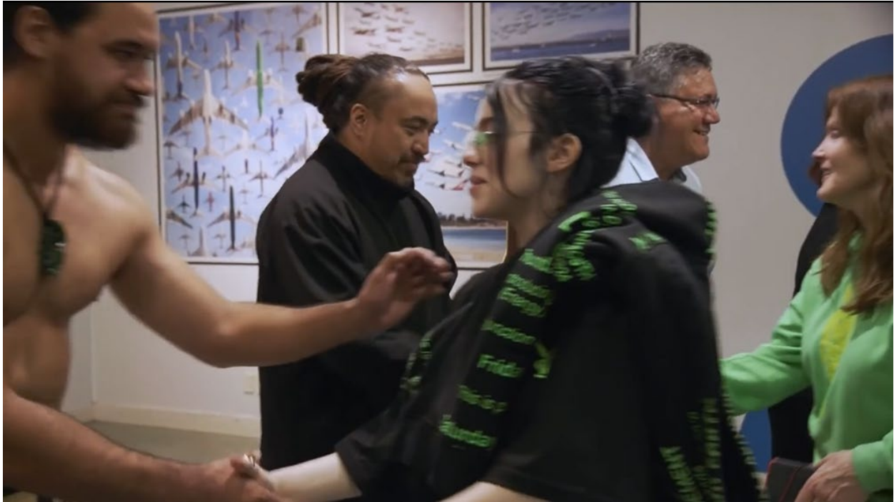
Figure 4(a), 1:34:00; 4(b), 1:34:01 12

the performance—before returning to a wide-angle shot to depict the performers in full once more. Thus, the photographs visible in this shot, too, are of de minimis use.