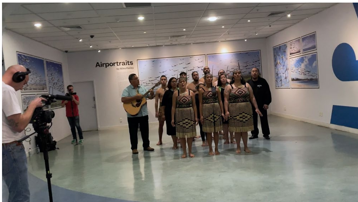
Figure 2, 1:33:33 9

As Figure 2 shows, all three walls of the exhibit are in view in this shot, with the exhibit again comprising the background of the scene. The left wall is now visible, featuring Compl. Exs. A (top left corner), B (lower left corner), C (far right), and D (second from the lower left). On the left wall in this shot, Compl. Exs. A, B, C, and D are each observable for approximately one second; they each appear in the background, at quite a distance, in poor lighting, and on a sharp angle. None of the left-wall photographs in this shot are readily recognizable as Plaintiff's; they are each either partially obstructed (Compl. Exs. A, B, and C) or almost totally obstructed (Compl. Ex. D) by the camera operators and their equipment. Compl. Exs. B and D, in particular, are almost totally indiscernible in this shot. See the Film, at 1:33:33–34. Again, similar to the work in Sandoval , 147 F.3d at 218, observability weighs in favor of de minimis use for the photographs marked Compl. Exs. A, B, C, and D in this shot.