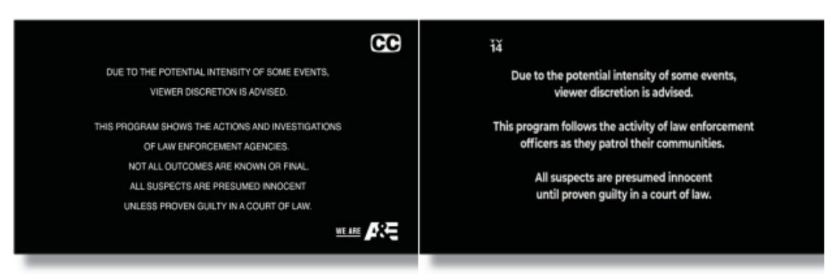
On Patrol: Live Introduction