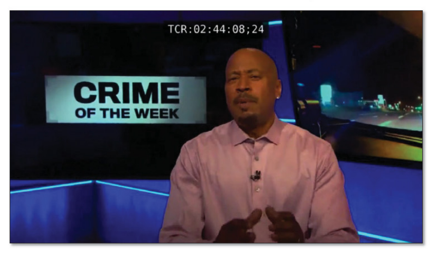
On Patrol: Live's "Crime of the Week" Segment